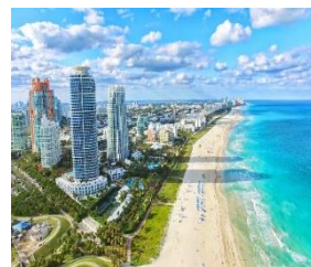
Miami Beach, Florida, USA