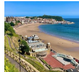
Scarborough, Holderness Coast, Yorkshire