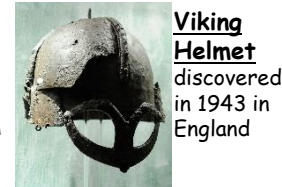
Viking Helmet discovered in 1943 in England