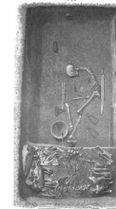
Excavation (Norway, 1889) The bones of a warrior.